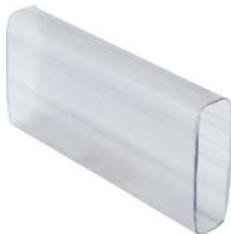
Rectangular Plastic Weep